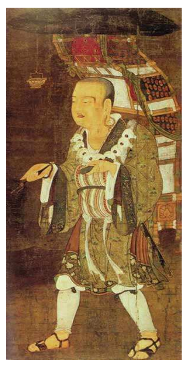
A Statue of the Reverend Xuan-Zang